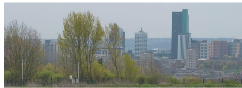
The skyline of Leeds gave us inspiration for our exhibit