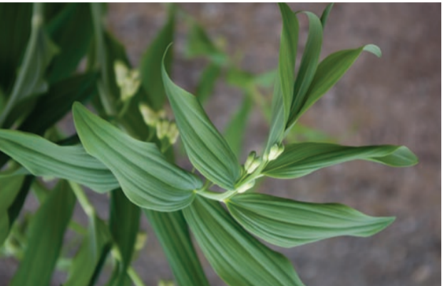
Hardy plants for tough places